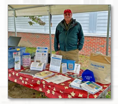
FHS Table at the Polls