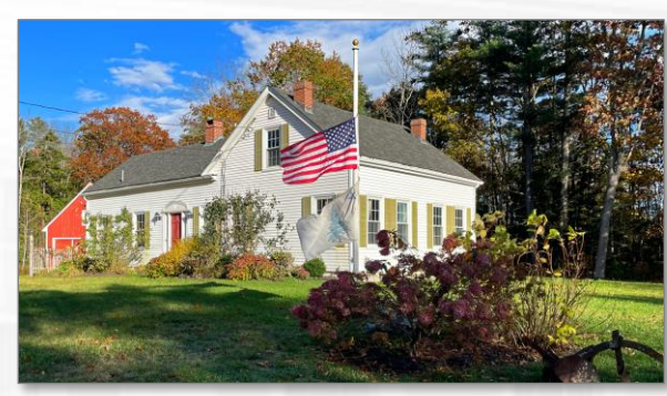
The Falmouth Heritage Museum and Barn