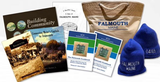
The Falmouth Heritage Bookstore