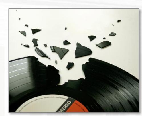
Presidents of all-volunteer nonprofits must sound like broken records