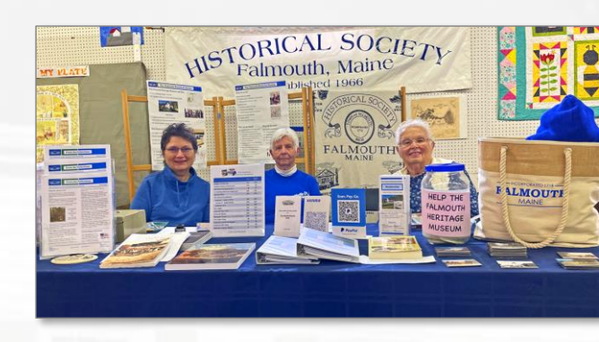
FHS Table at Cumberland Fair