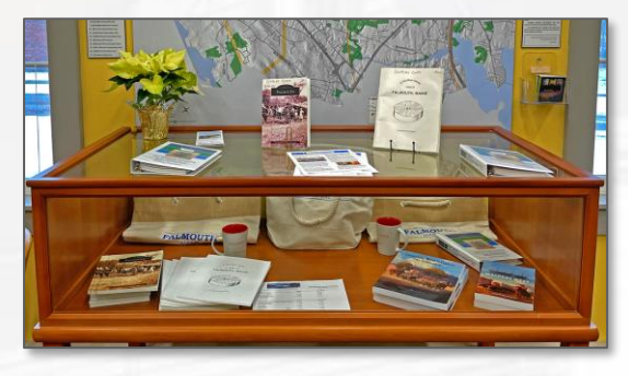
Falmouth-related Items at Town Hall